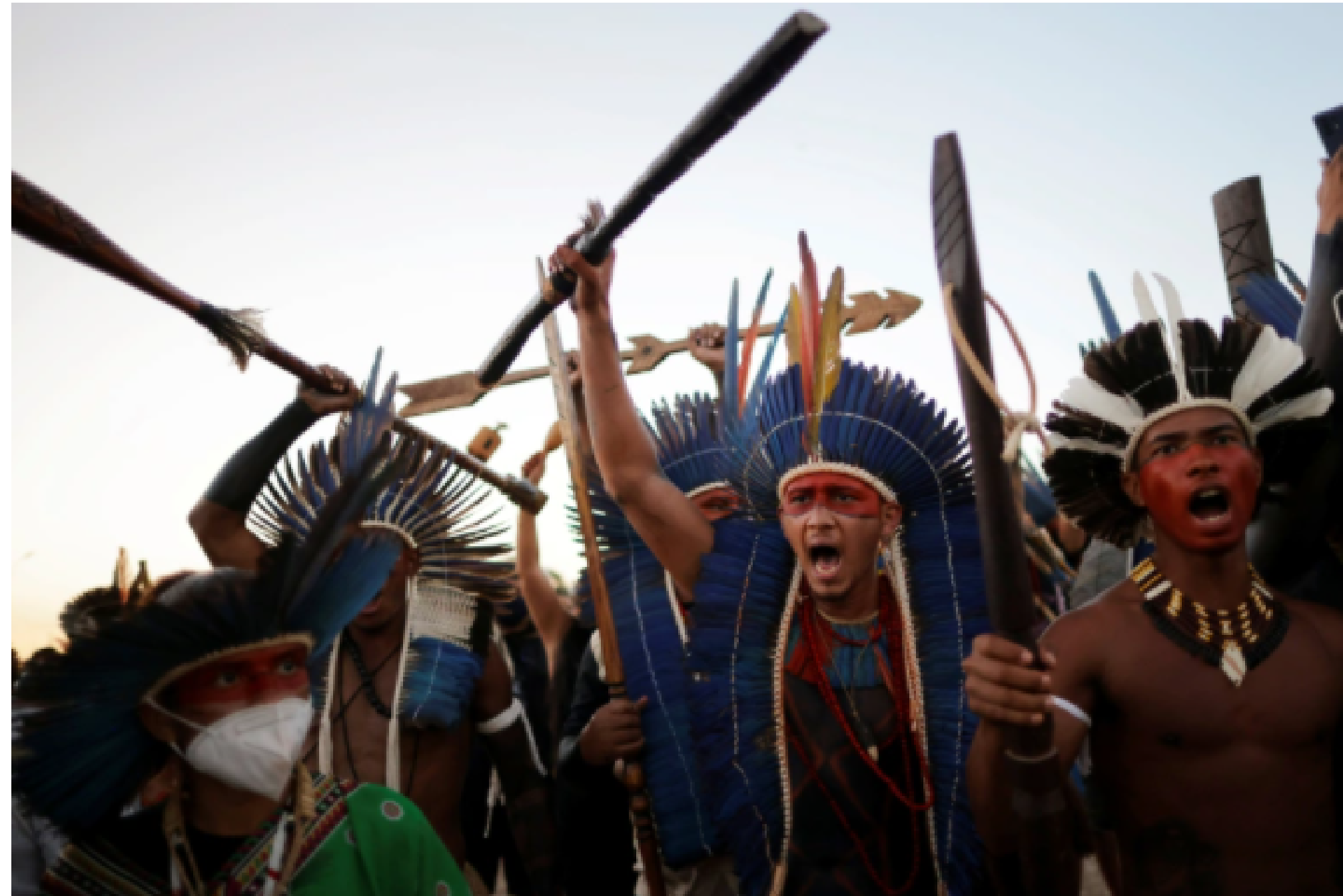
Indigenous people protested in June against commercial agriculture and mining on protected tribal reservations in Brasilia

Far-right president has led 'an explicit, systematic' anti-Indigenous policy since taking office in 2019, group alleges.